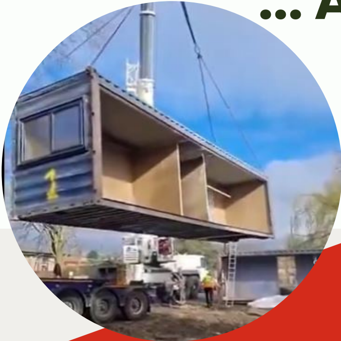
CONTAINERS ON SITE