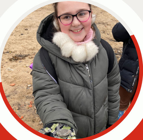
Fossil hunting in Whitby.