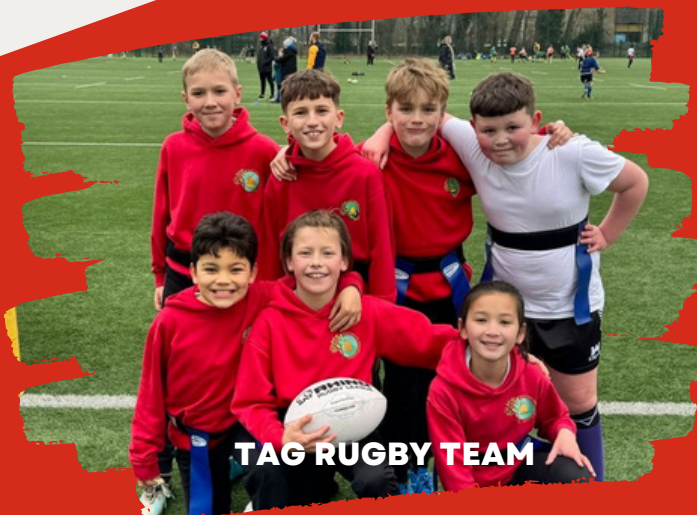
TAG RUGBY TEAM