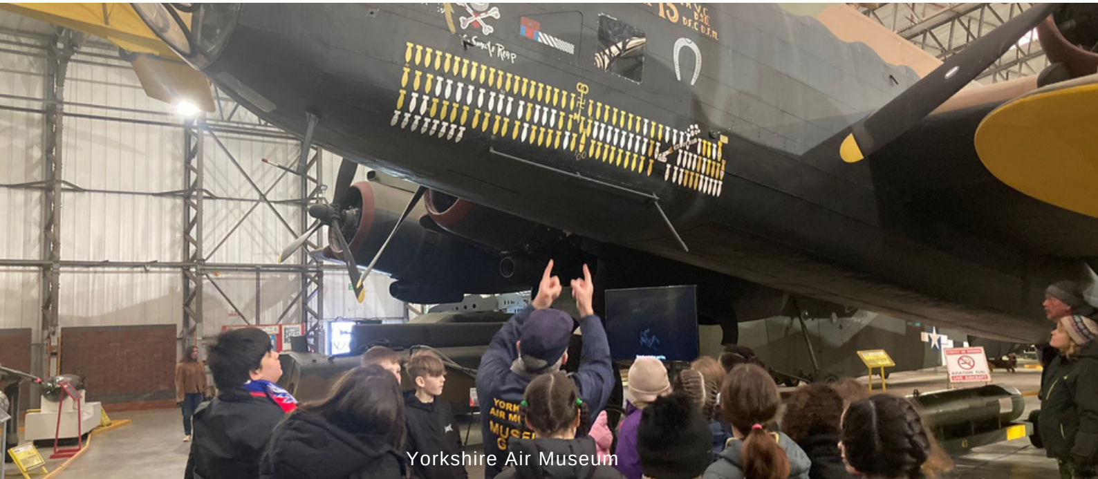
Yorkshire Air Museum