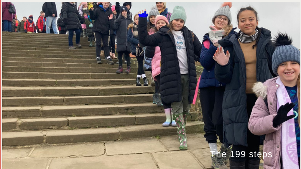
The 199 steps